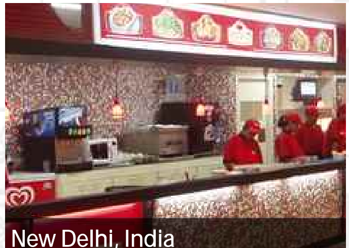
New Delhi, India

The first Mark Pi's in Korea opened in the summer of 2004. Due to the success of the first store, our franchisee recently opened two more Mark Pi's within the last three months and adding at least 4 more locations within the next 12 months!