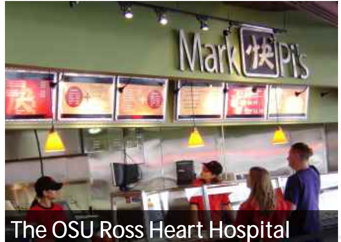
The OSU Ross Heart Hospital

Mark Pi's Express celebrates its 10th year in Fishers, Indiana with a new make over. The first candidate among current franchisees to renovate an old Mark Pi's Express into the new prototype. Customer feedback has been overwhelmingly positive towards the changes in design and menu selection.