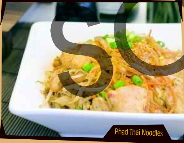
Phad Thai Noodles

Rice noodles wok tossed with eggs, bean sprouts, scallions, and carrots with our phad thai sauce.