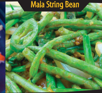
Mala String Bean