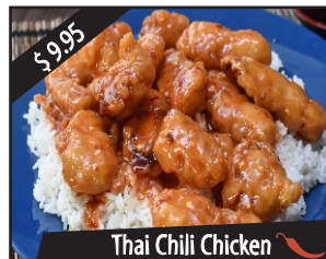
Thai Chili Chicken