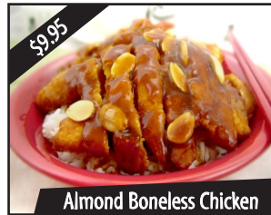
Almond Boneless Chicken

Served with Steamed White Rice Substitute Egg Fried Rice for .75 extra