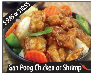
Gan Pong Chicken or Shrimp