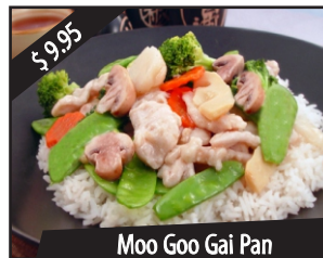
Moo Goo Gai Pan