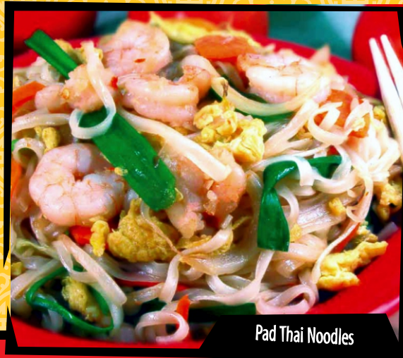
Pad Thai Noodles