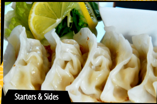
Starters & Sides